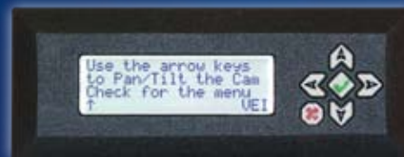
Apollo II LCD Control-Unit