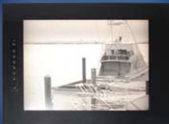
Apollo Thermal Image viewed on Optional VEI Monitor

OceanView Technologies Thermal Camera Systems offer you the piece of mind to boat safely and enjoyably at night. The Apollo II HD camera delivers more than four times the resolution than that of other cameras. Sharp detail and double the range at a reasonable cost. Combine the High-Definition thermal imager with the laser sharp low-light imager and you have the industry leading, state-of-the-art, Apollo II HD.