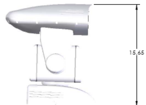
Dimensions in Inches