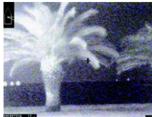
Ultra Low Light Camera