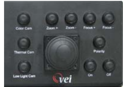
Outdoor Waterproof Controller

The Atlas Camera System is ideal for private vessels such as Mega Yachts, Expedition Yachts, & Sportfishing Yachts as well as commercial vessels.